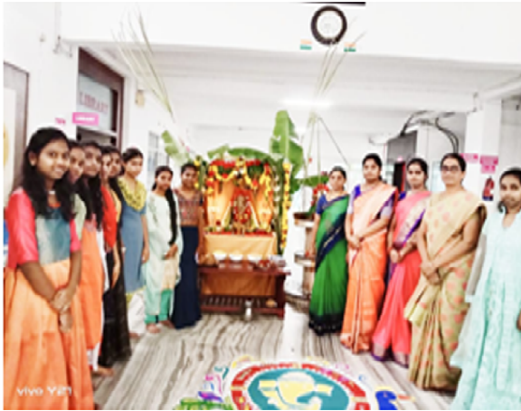
VINAYAKA CHAVITHI CELEBRATION