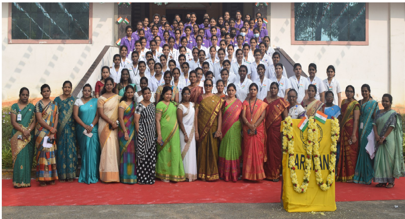
Narayana College of Nursing, Teaching with Students