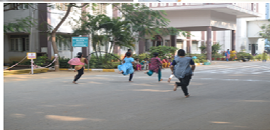
Spot Face Painting