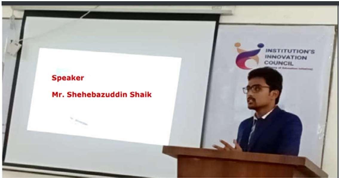
Session on his Invention