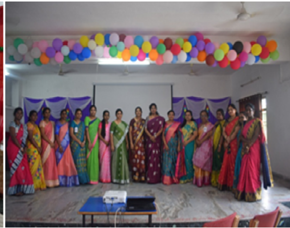
WOMANS DAY CELEBRATION