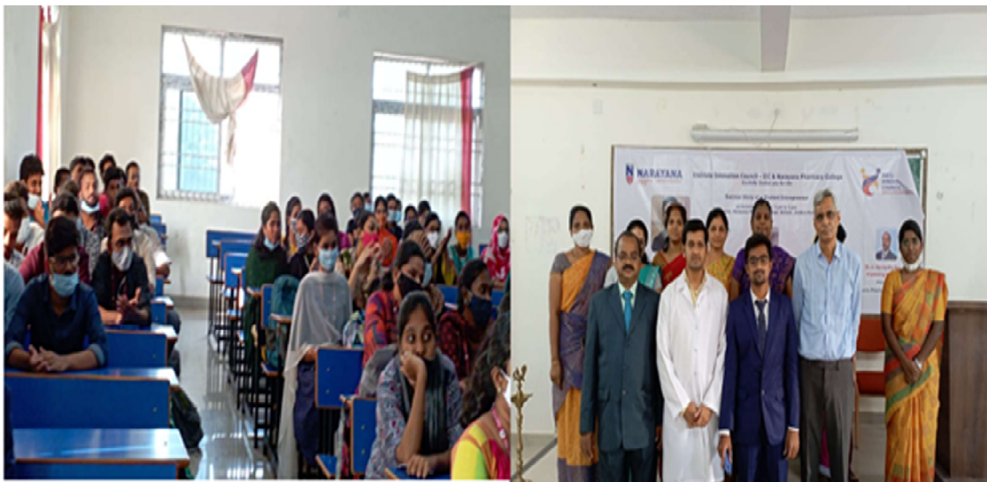
Group Photo after session

Success session was ended with Vote of thanks and National Anthem.